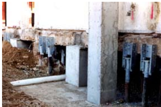
Foundation support of 3 story Science Building, Western State College. ---Gunnison, CO

P ier systems can be installed in either an interior or exterior location. Every pier system provides for a two-stage system of initially driving the manufactured piers to a load-bearing support, then using hydraulics, restoring the structure to the desired elevation.