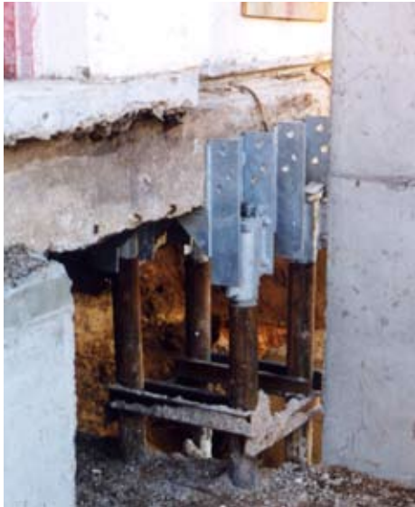
Foundation support of 3 story Science Building, Western State College. ---Gunnison, CO

F oundation underpinning is a process of modifying the existing foundation system of a structure, which is unable to carry existing loads or additional loads within the existing soil conditions.