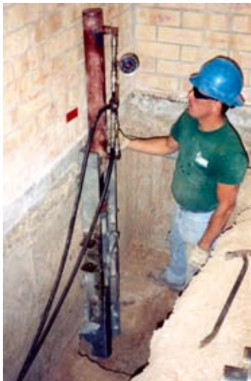
Underpinning at Northwest Community College. --- Rangely, CO

From underpinning multi-story buildings and bridges to small commercial buildings and residential structures, MCSI has the experience and proven record to handle a wide range of foundation mitigation and underpinning.