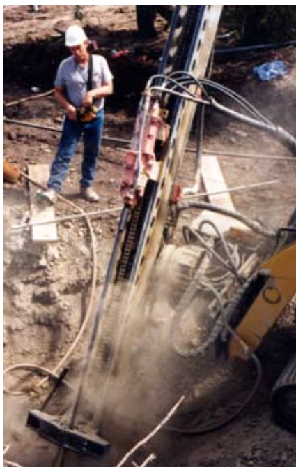
Installing rock anchors on mountain peak for television tower foundation. --- Grand Junction, CO