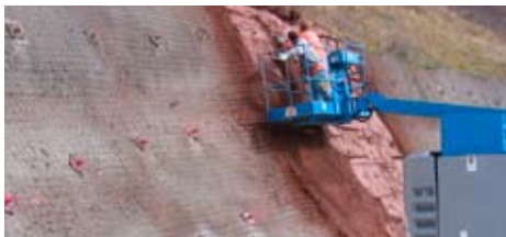
Soil nailed wall with carved shotcrete.