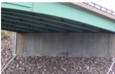
Soil nailed overpass abatement.