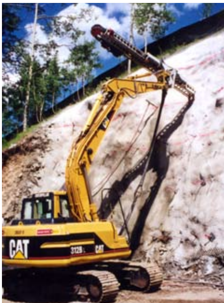
Temporay soil nail wall for 1 million gal. underground water tank. --- Crested Butte, CO

The soil nailing involves placing closely spaced steel nails (rods) into the excavated or sloped soils and installing wire mesh reinforcement and/or applying shotcrete on the face.